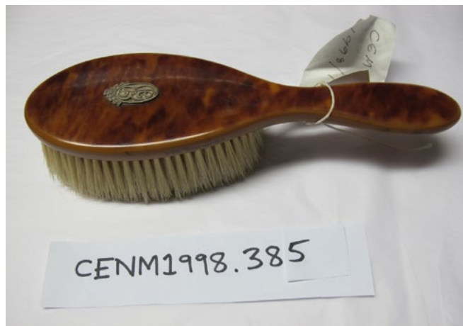
Tortoiseshell hairbrush prop from the movie Titanic .