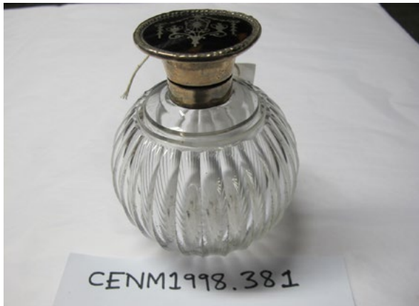
Powder bottle prop from the movie Titanic .

There are several objects from the debris field of the wreck site here as well as props from James Cameron's 1997 movie!