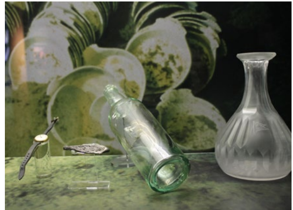
Items from debris field.