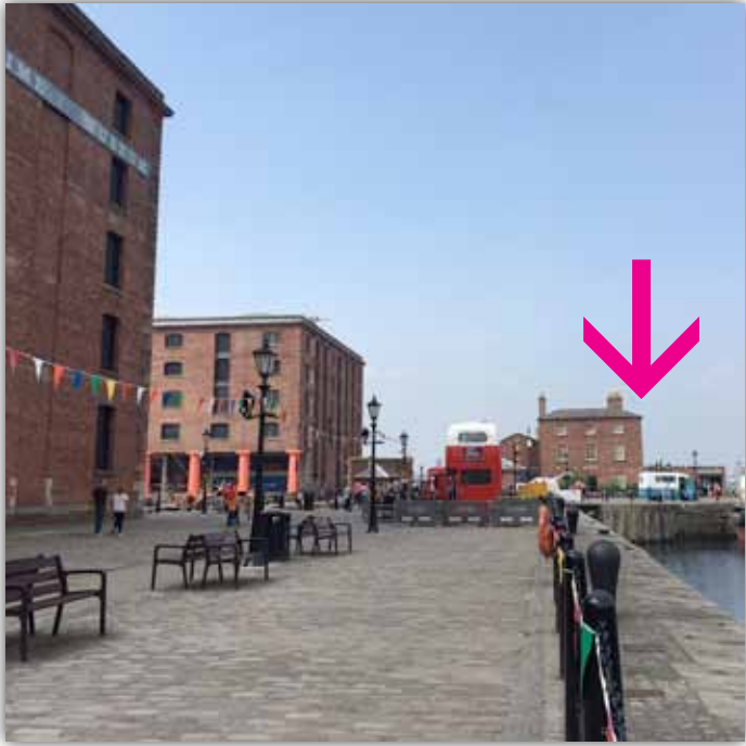
Approach to Piermaster's House from the entrance of Merseyside Maritime Museum