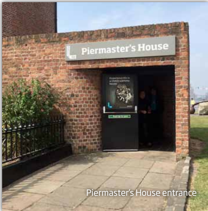
Piermaster's House entrance