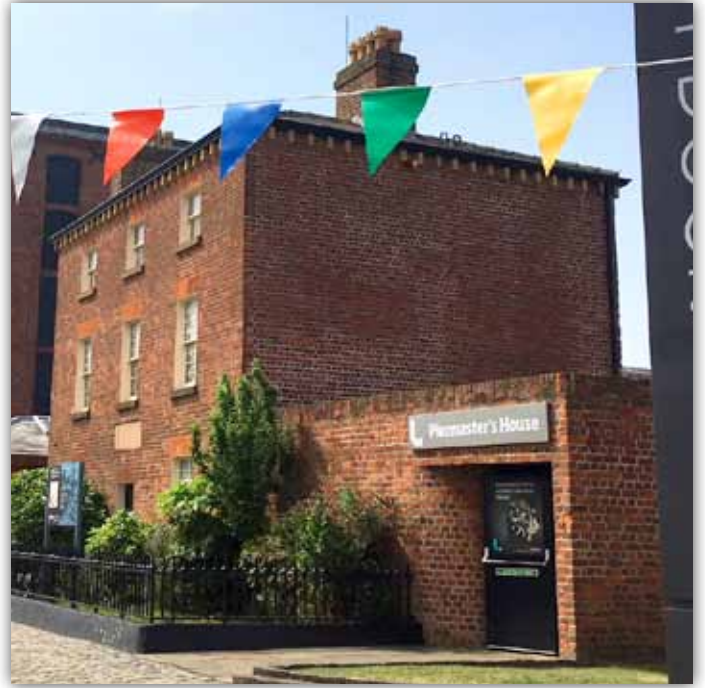
Approach to Piermaster's House from the Museum of Liverpool