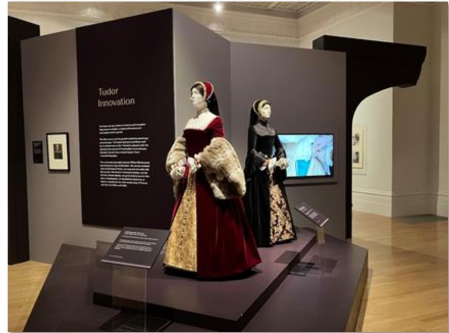
A picture of the mannequins in the final exhibition space.

Two static mannequins mark the final space in the exhibition and take visitors into a contemporary art display exploring the legacy of African Tudor trumpeter John Blanke. Visitors then exit the space into the exhibition shop or foyer.