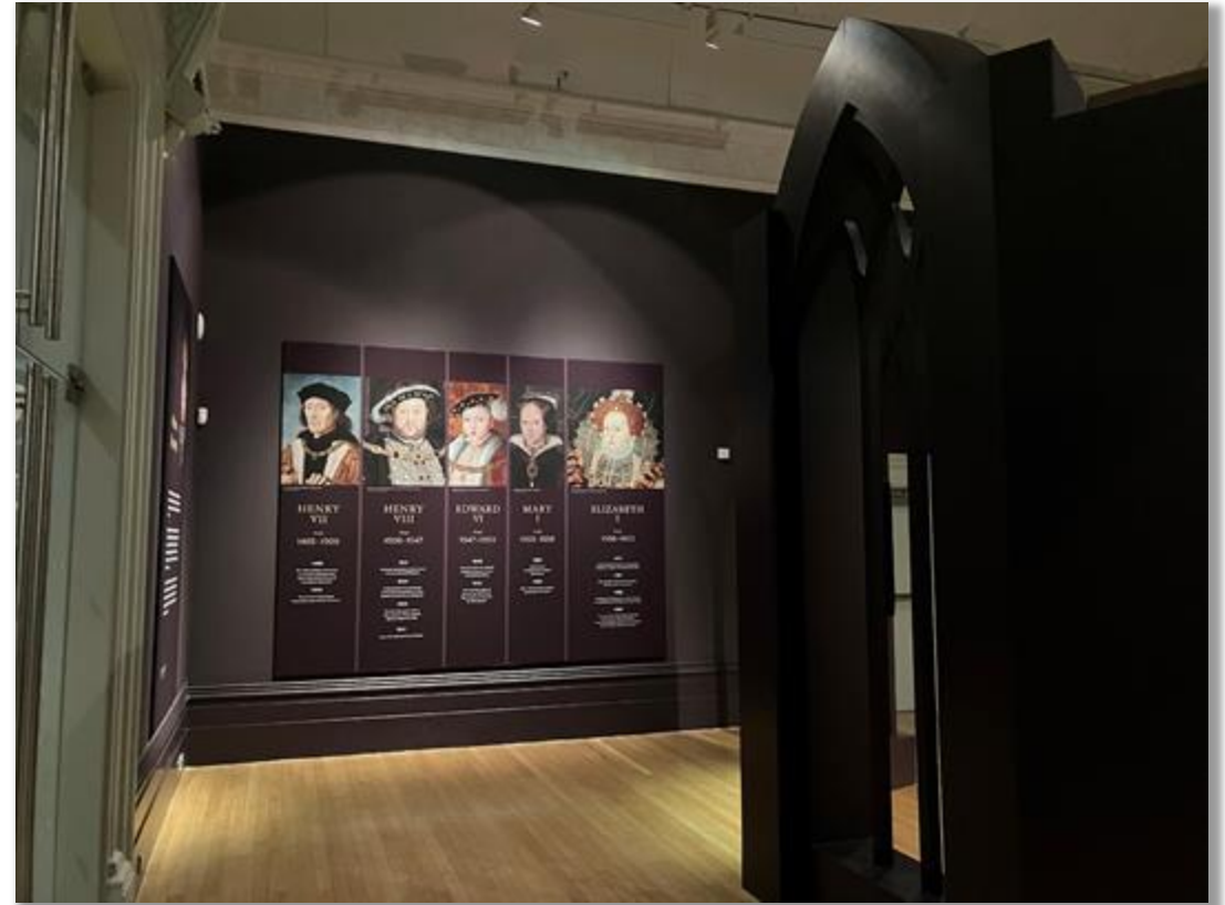
A picture of the walkway in the exhibition, including suspended arches. Demonstrating the light changes.