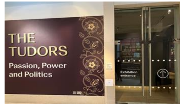
A picture of the title wall and glass double door.

During the guided tours Tuesday to Sunday 3-4pm and during school visits .