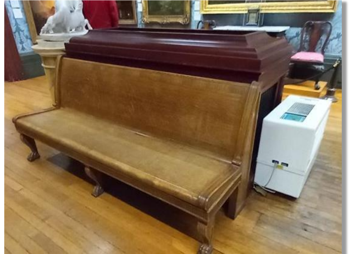
A wooden bench with no fixed armrests, on wooden flooring. A large white humidifier is located next to the bench.

Black fold out stools are available at any point in your visit. Please ask our staff for more details or need assistance.