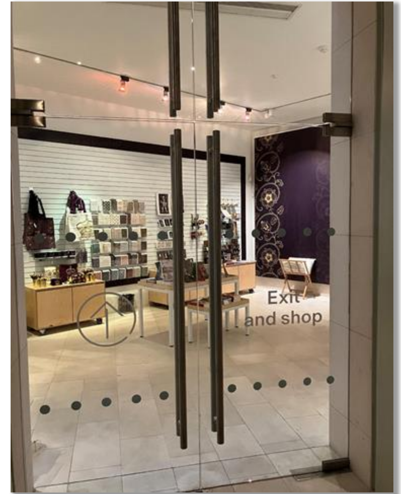
A picture of the glass doors leading to the exhibition shop.