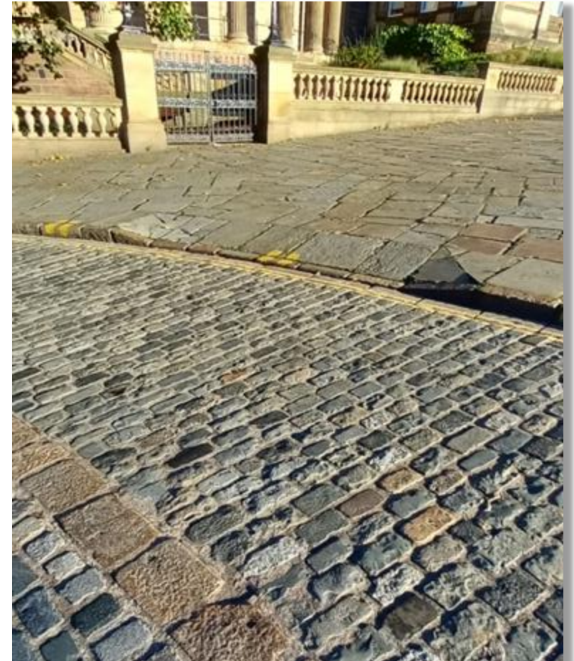
The cobbled floor area outside the Walker Art Gallery.

Guide Dogs and assistance animals are welcome