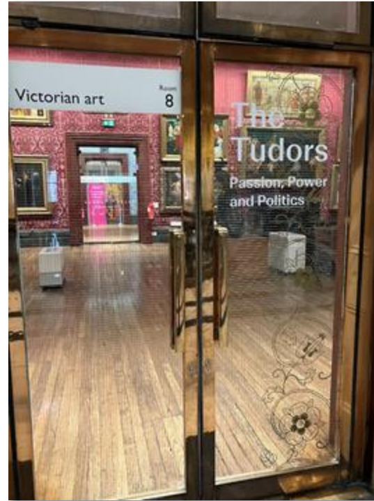
Signage on the glass door directs visitors to the exhibition entrance.