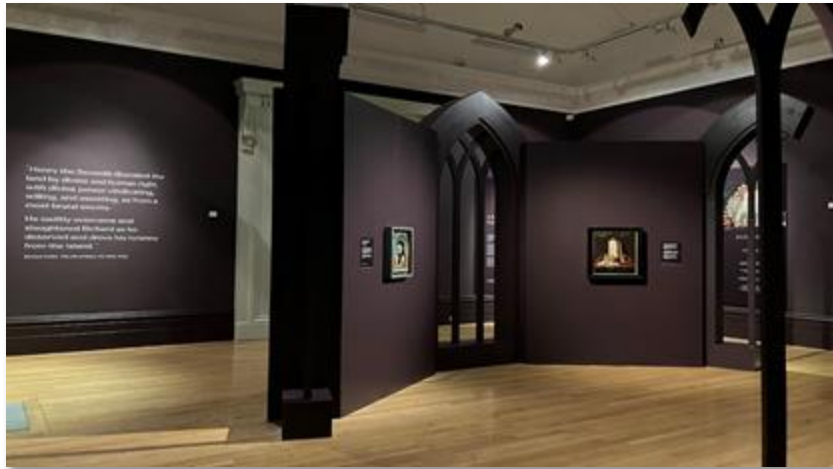
A picture of the walkway in the exhibition, including suspended arches.

The lighting within this exhibition varies, please be careful when walking through the exhibition.