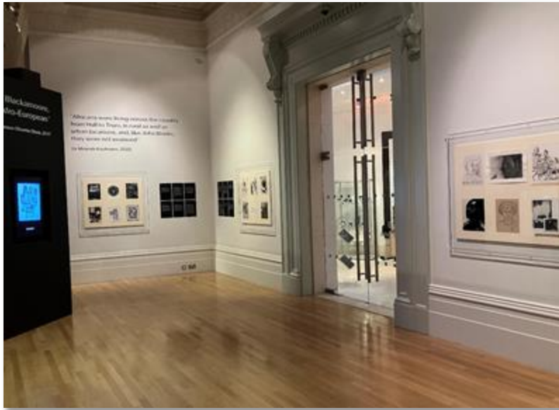
A picture of the exit leading to the exhibition shop. This includes a pair of glass doors.

You are welcome to continue your visit through our permanent collection galleries, which are free to explore.