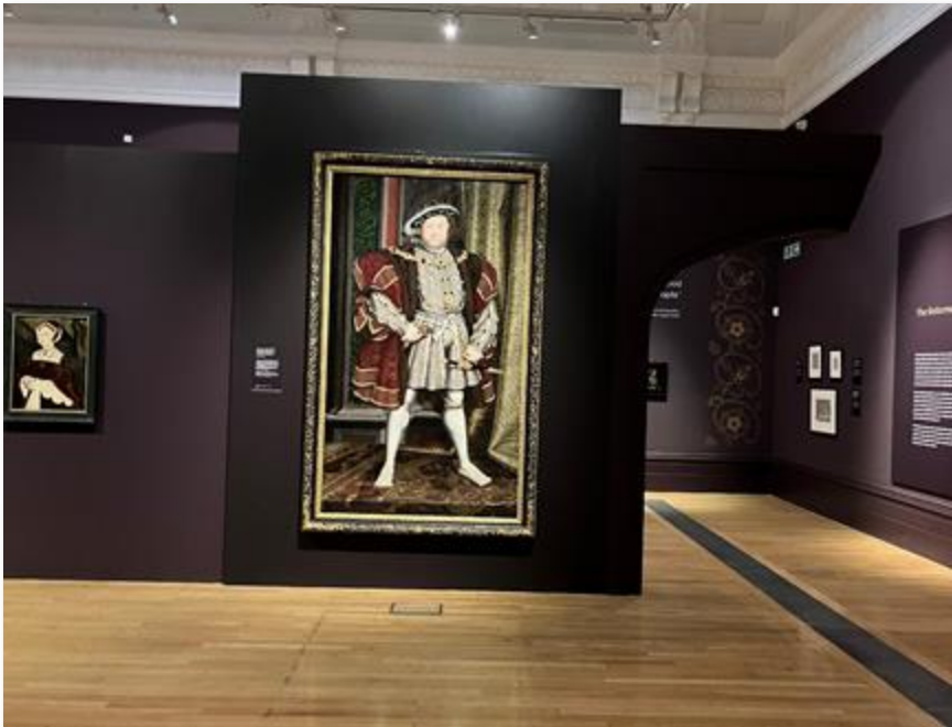
An image of a Henry VIII painting.

There is a suggested route through the exhibition, follow this to see the famous portrait of Henry VIII. This takes you through to a large room filled with many more incredible paintings and objects from the Tudor times.