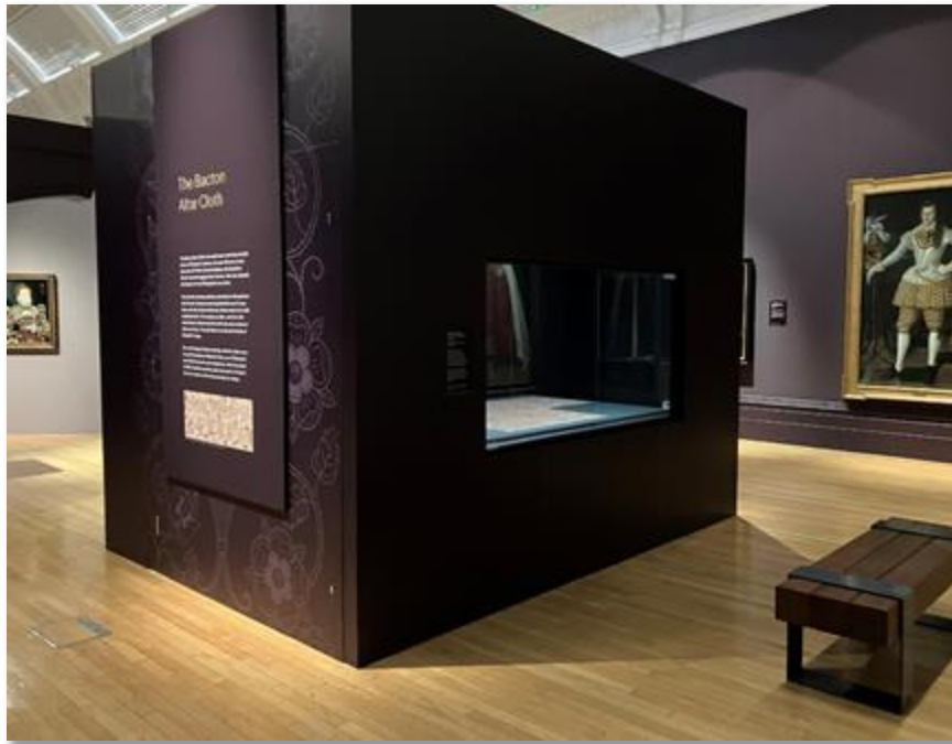
An image of the freestanding information boards and wooden bench.

Seating is provided at intervals throughout the exhibition. If you would like a portable stool to carry with you, please ask a member of staff.