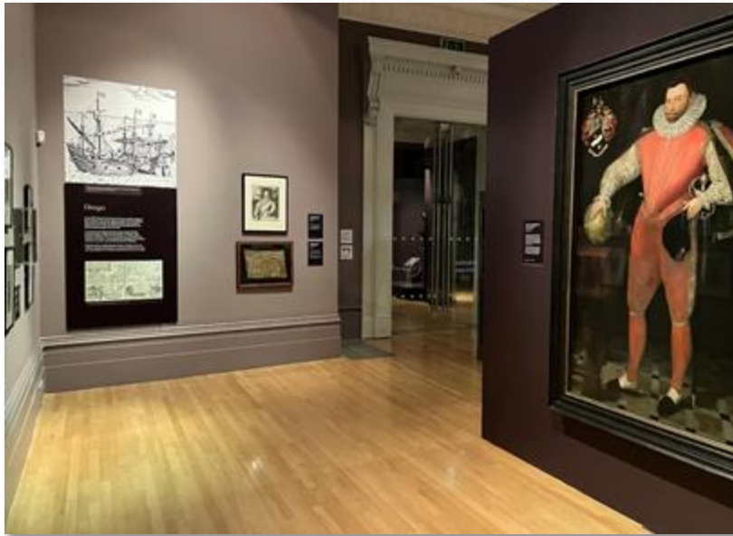
A picture of the walkway in the final room of the exhibition.

Near the world globe display case you will see a set of glass doors which take you back to the first room of the exhibition, if you choose to revisit this space.