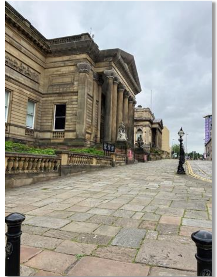
A view of the outside of the Walker Art Gallery.

Our contact details can be found on the last page of this guide.