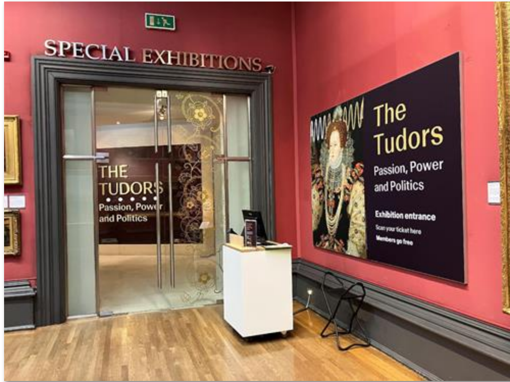
A picture of the special exhibition entrance including glass doors.

Staff will welcome you and scan your ticket at the ticket desk in room 9