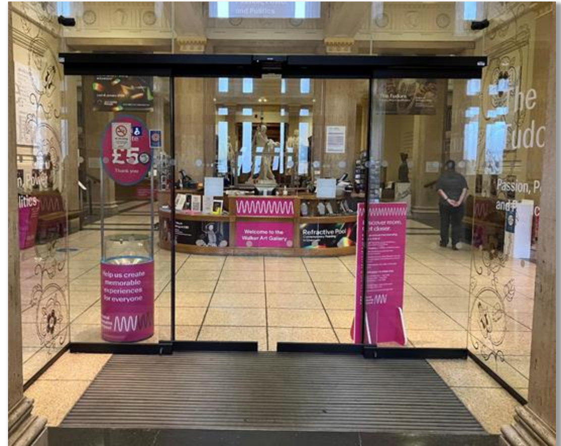
The glass entrance doors at the Walker.

Our security team will help ensure you have an enjoyable visit. We do use security measures to ensure the safety and security of all our people and collections, they are designed not to be intrusive. If you have any concerns, please don't hesitate to contact us in advance.