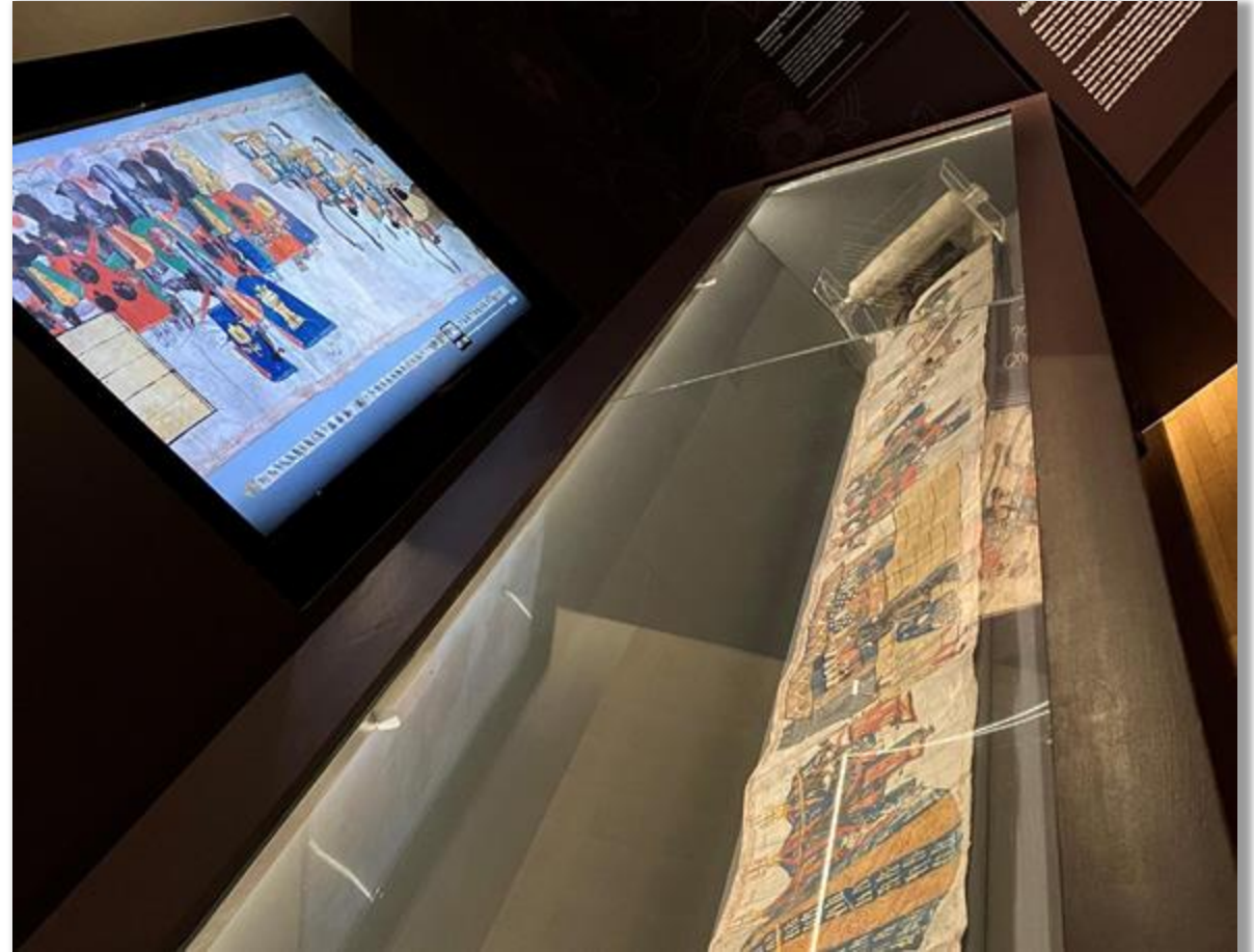
An image of the video screen above the Westminster Tournament Roll.

There is a video screen above the roll which moves slowly showing you the full length of the roll as only a portion is on display.