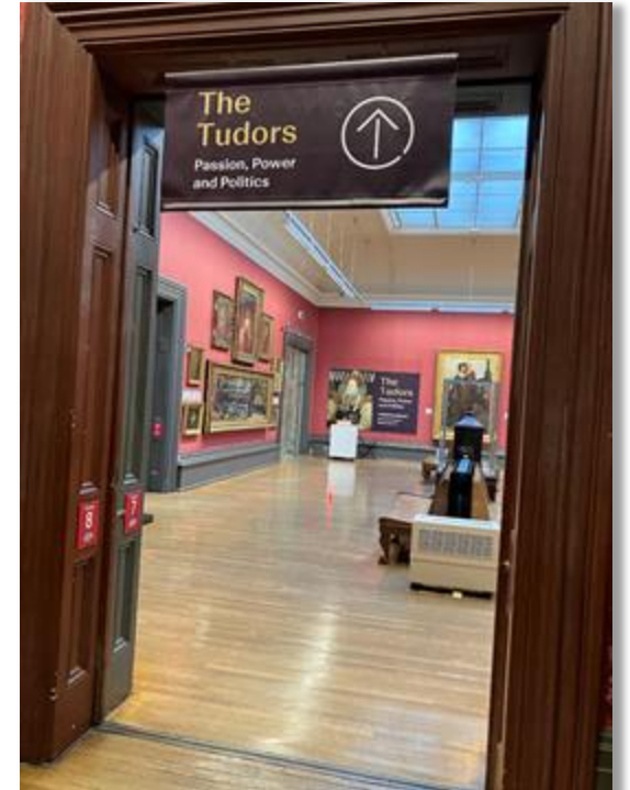
Signage above the doorway directs visitors to the exhibition entrance.