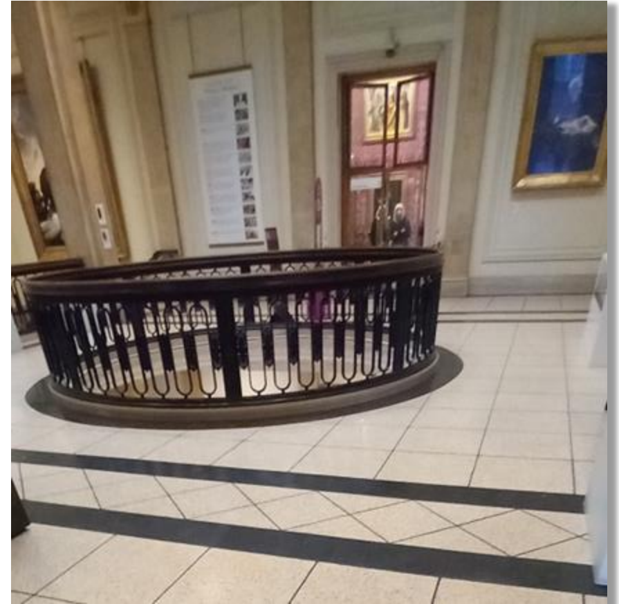
First Floor landing area with stone floors.

Noise defender headphones or earbuds may be useful in these galleries and during your visit.