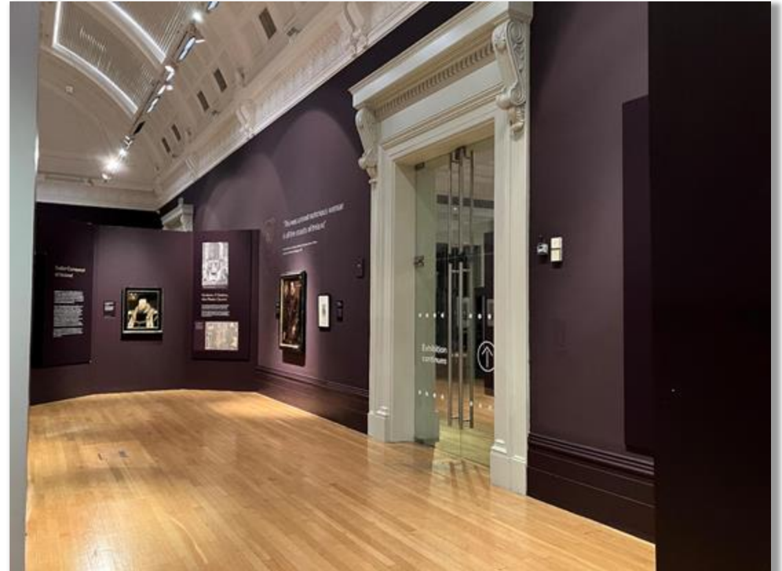
A picture of the walkthrough to the final exhibition room. Includes a pair of glass doors.